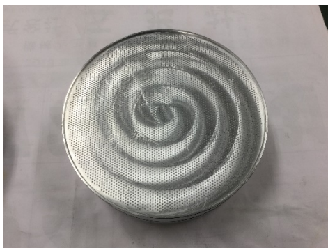
Detector head of large Sci-Fi detector installed on 8-O port. Approximately 5000 fibers are embedded.