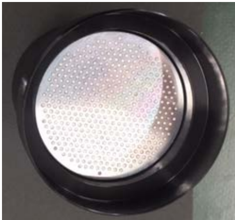
Detector head of middle Sci-Fi detector installed on 8-O port. Approximately 500 fibers are embedded.